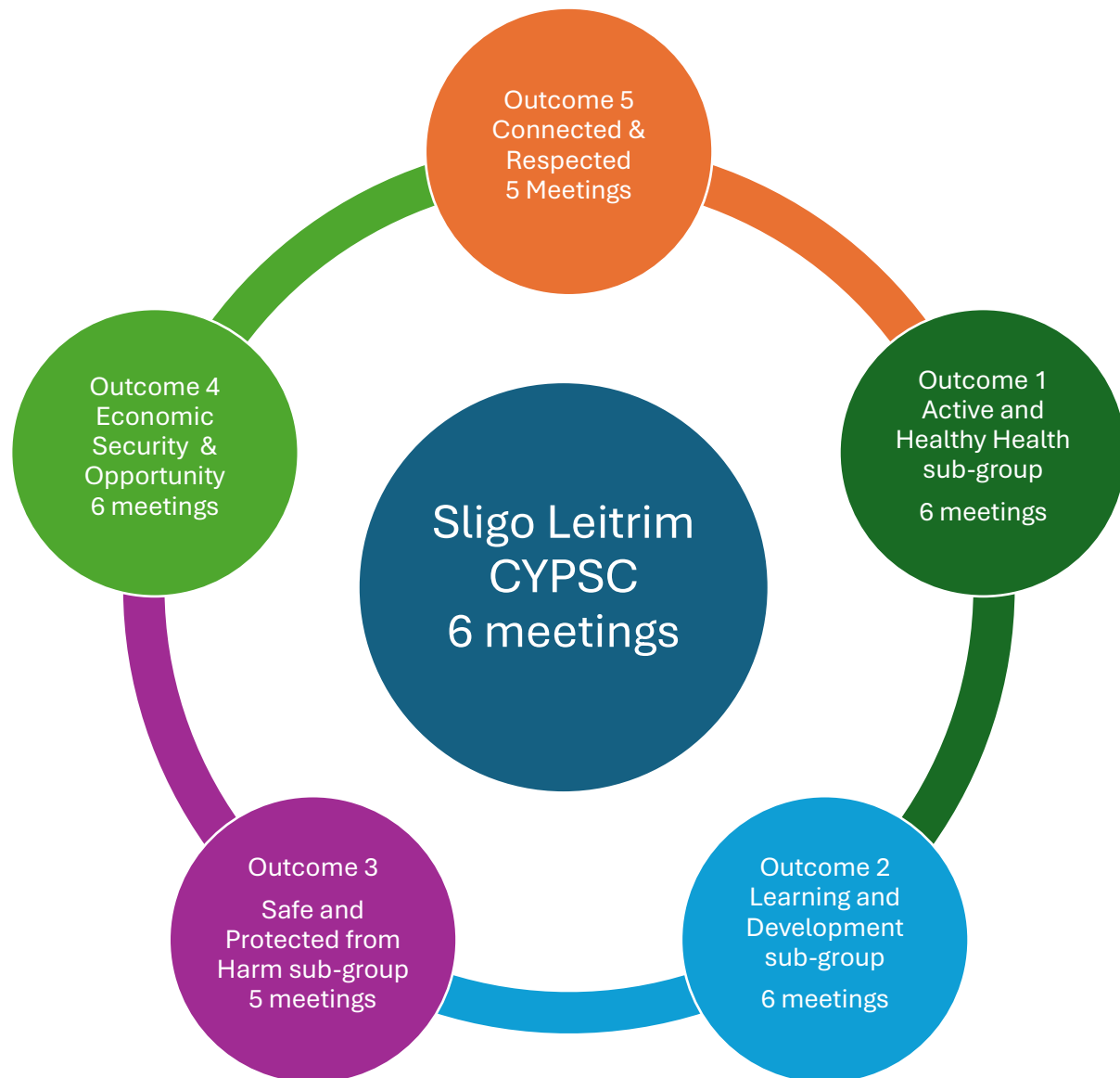
Figure 3: Summary outputs

During 2024 Sligo Leitrim CYPSC met on 6 occasions with sub-groups meeting collectively 28 times .