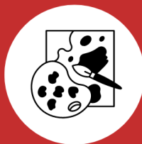
Arts and Crafts