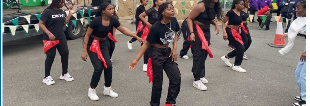
The Dance Troupe from the Port Road Apartments—heroes of entertainment yet again... this time performing at the Family Fun Day organised by the MacCumhailis GAA club, Ballybofey and supported by Donegal Intercultural Platform. Well done club - well done dancers!