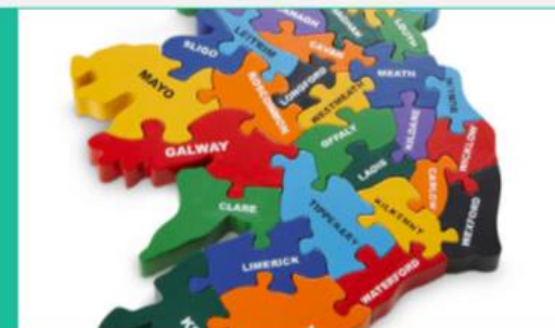
Special Interest Supports