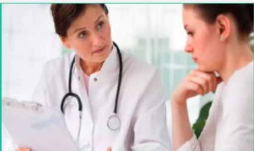
Health & Wellbeing