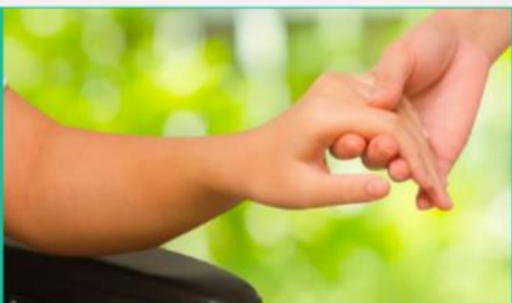
Safe & Secure