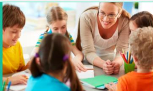
Education, Training & Employment