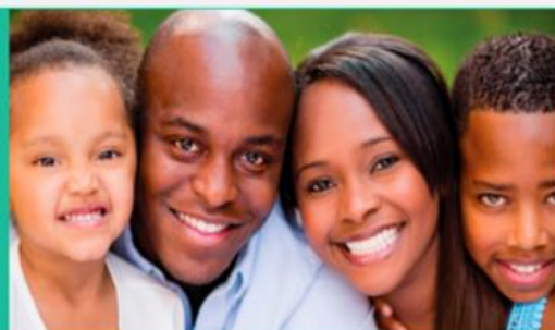
Parent & Family