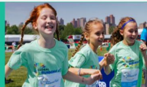
Recreation & Community