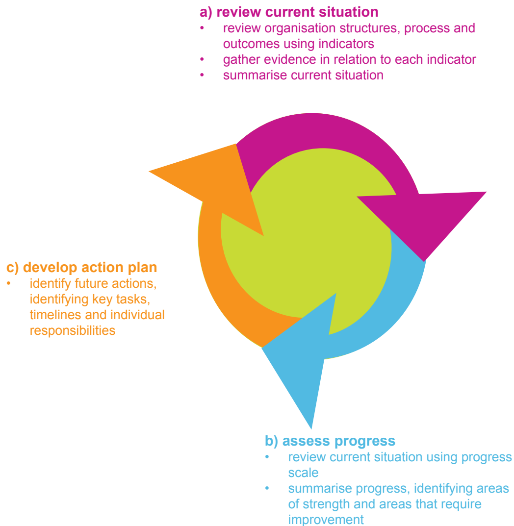
Figure 1: Process for working on quality

Achieving quality is not an event; it is an ongoing process of striving for improvements in service delivery. Key aspects of quality include: designing and delivering services that meet the needs of children and families and achieving positive outcomes through effective, accessible and inclusive services. Continuously working on quality involves engaging in the following steps (as depicted in Figure 1 below): a) reviewing current situation; b) assessing progress; c) developing action plan.