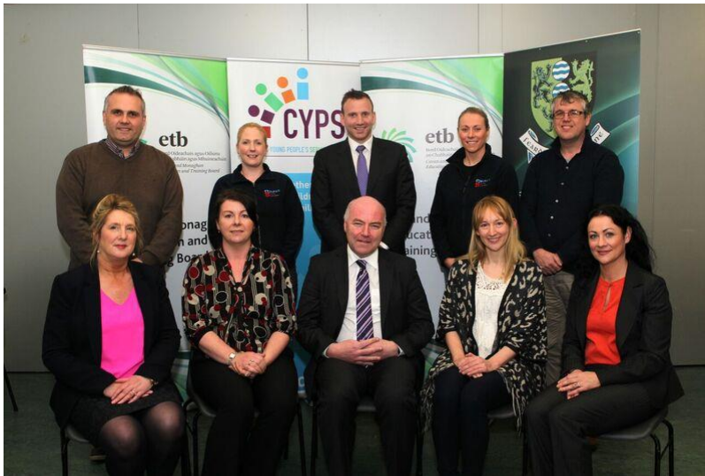
(Launch of Bounceback Youth Service in Belturbet)

Both CYPSCs will annually receive an allocation of Seed Funding to help the development of the Children and Young Peoples Plans for both counties and to develop and encourage interagency initiatives in both counties.