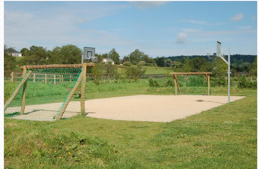
Baltinglass Teen Area