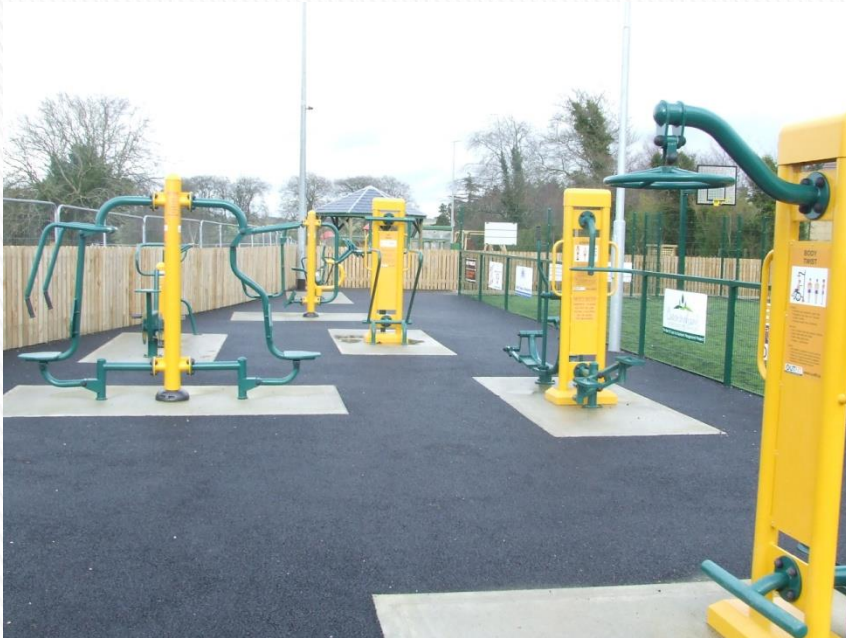
Adult Outdoor Gym